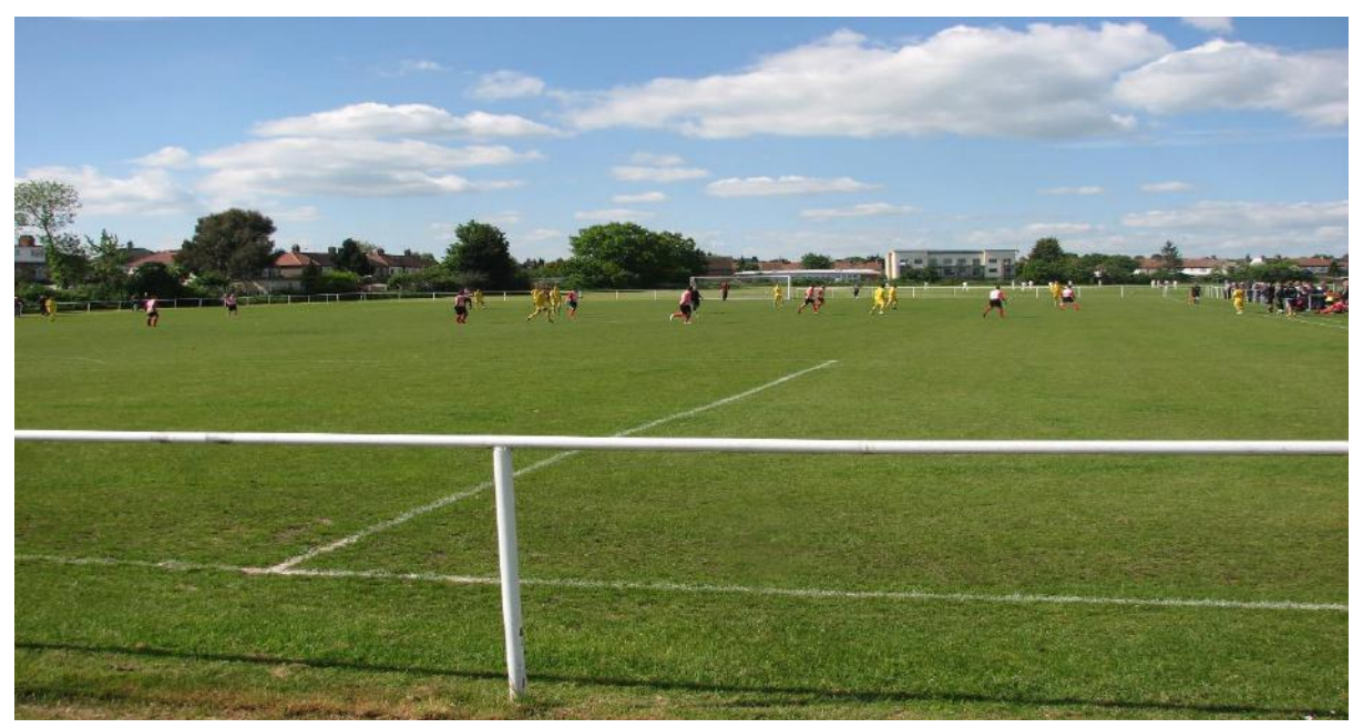
This is the normal way it looks

is at the top of the car park on the left and if you wish a nice pint go past the lane and you will receive a nice friendly welcome in the Rose and Crown, Queens Head and Green Man.