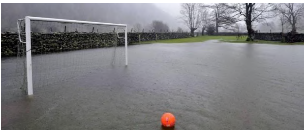
Anybody for Water Polo Ref or is the game off

Away: Sky Blue Shirts, White Shorts, Black Socks